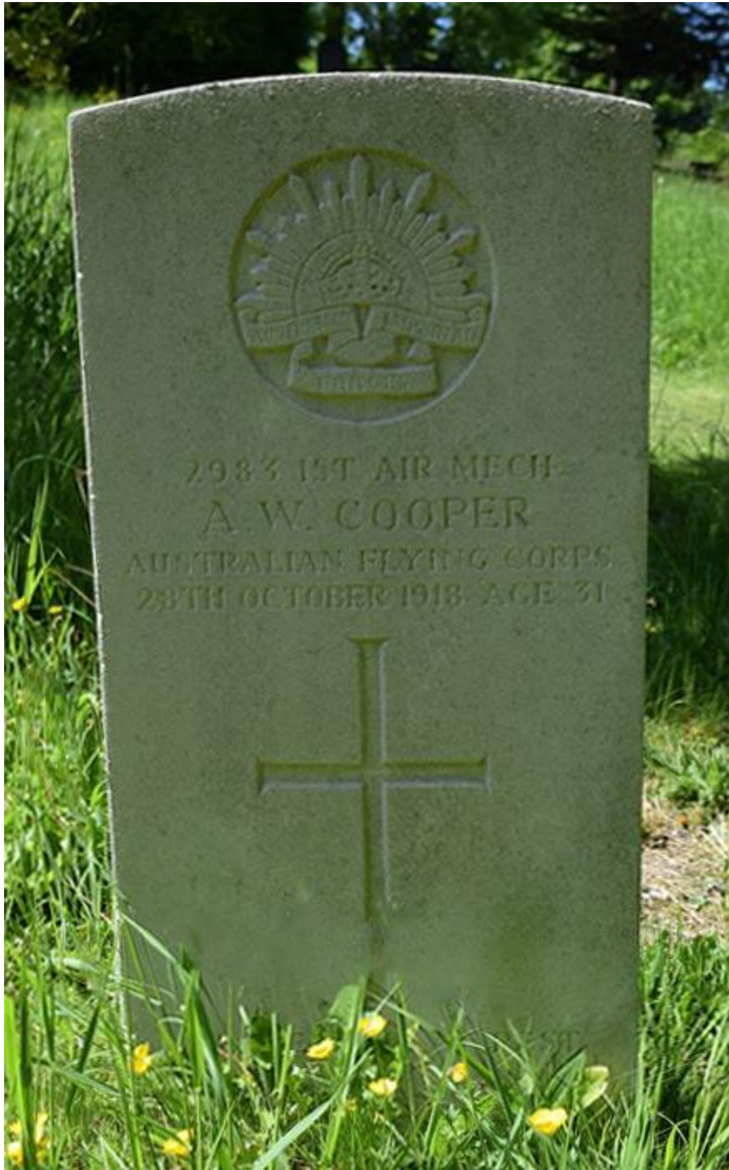
Photo of 1st Air Mechanic A. W. Cooper's Commonwealth War Graves Commission Headstone in Brighton Extra – Mural Borough Cemetery, Brighton, East Sussex, England.